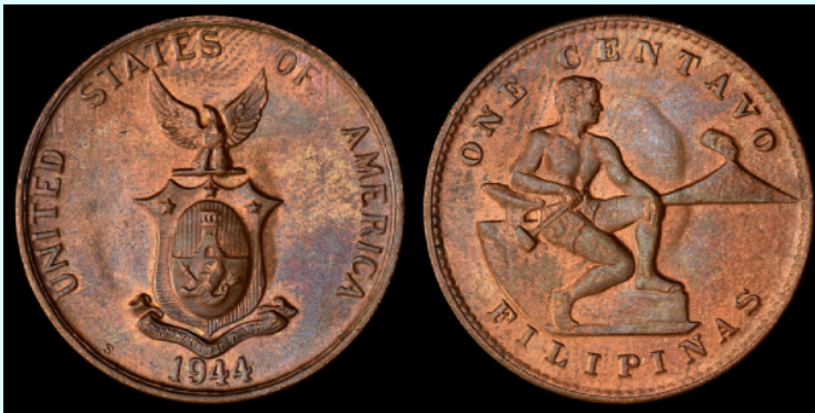
Lot 2: 1944 (S) Philippines, One Centavo, KM-174 Unc RB