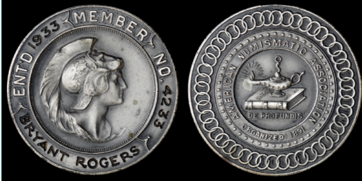
Lot 1: 1933 ANA Membership Medal