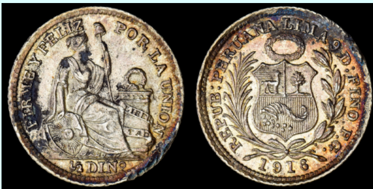
Lot 3: 1916/5 Peru, 1/2 Dinero, KM 206.2, AU Details